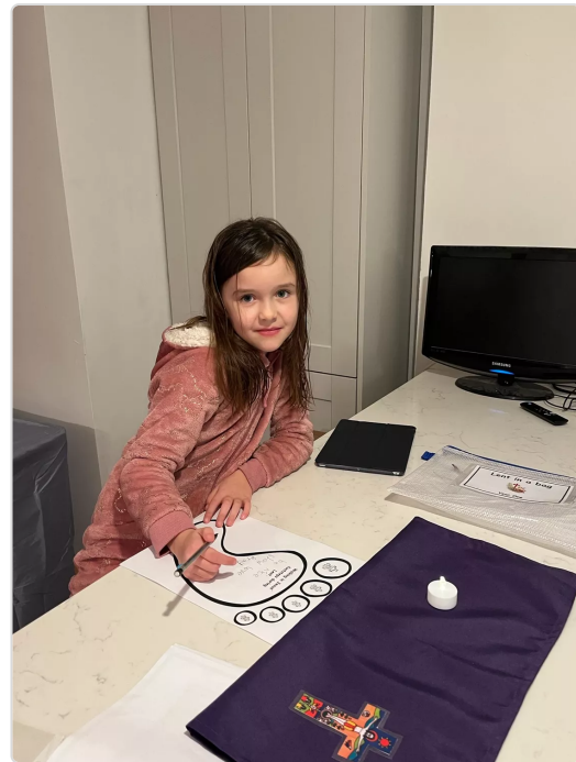
Rose will follow in Jesus' footsteps by -

Being kind, thinking of others, and respecting people.