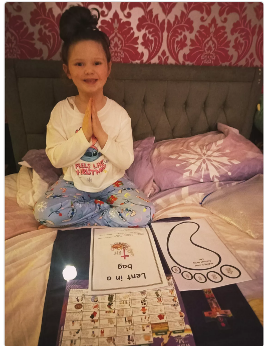
I will follow Jesus by...