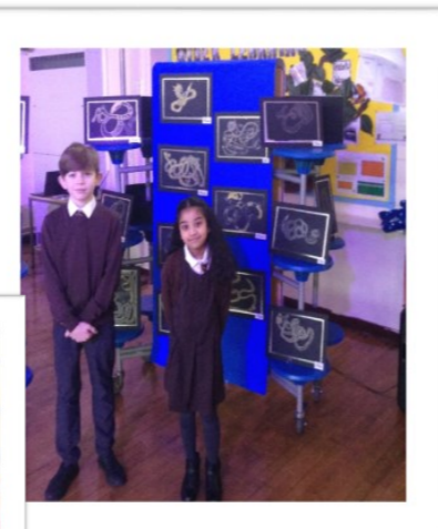
Some smart School Council members supporting our exhibition this morning.