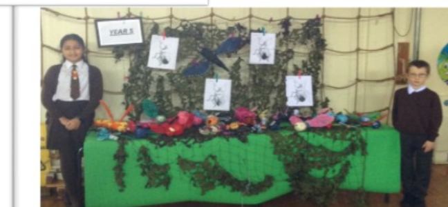
Some smart School Council members supporting our exhibition this morning.