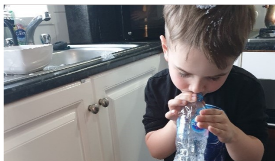
Who ever suggested that learning could not be great fun?