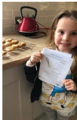
A recipe used during rationing, replicated brilliantly.

The reports were well received. Thank you to staff for their co-operation – and also to the many parents who replied in whatever way. It is teamwork at its best. I always appreciate it when parents ask questions or check things that they are not sure of – we are so much stronger working as a team. Thanks also to the lovely appreciative comments received – I have passed them on to staff.