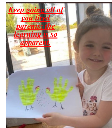
Keep going all of you tired parents: the learning is so apparent.

Well done! I need the evidence to put on the website for ALL of your friends to see.